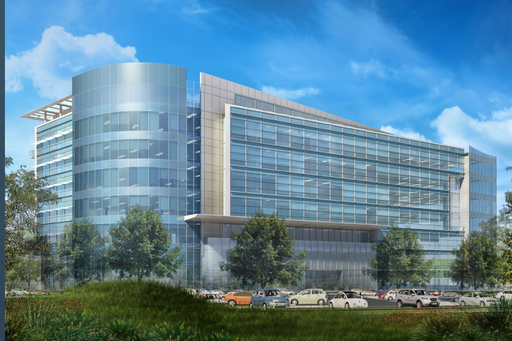
View from Java Drive and Crossman Avenue