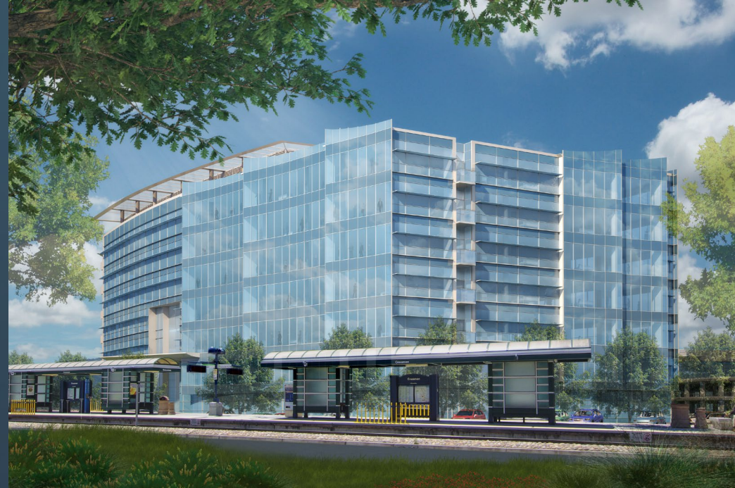
View from Moffett Park Drive and Crossman Avenue